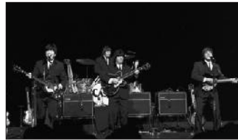
THE "CAST" OF BEATLEMANIA