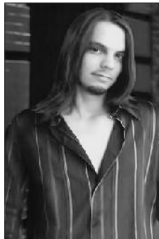
CHASING SOMETHING BETTER